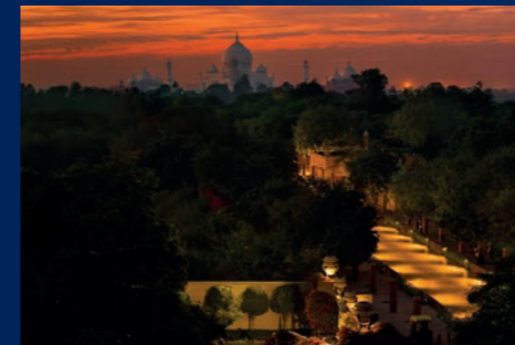
Lighted path leading to the Taj Mahal