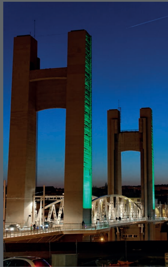
Pont de Recouvrance in Brest

• CONSTANT INNOVATION: through our integrated engineering design office