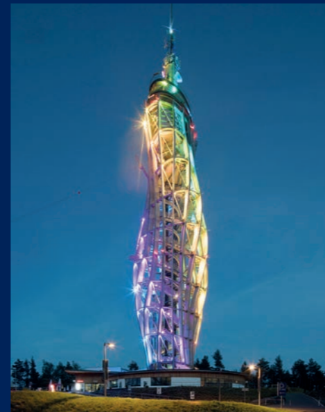
Pyramidenkogel Tower in Austria