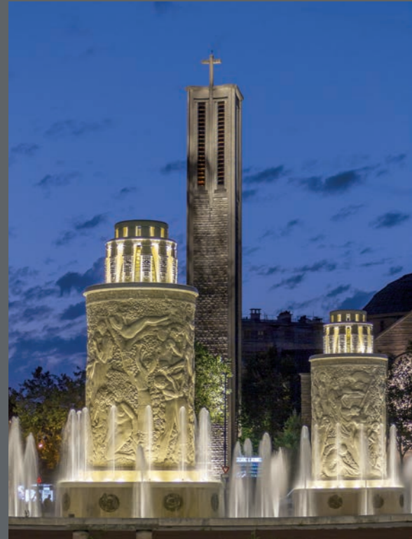
Landowski Fountains in Paris

LEC is a family business founded in 1977 and has a unique history centred on passionate, experienced people working in the sector of exterior lighting and marker lighting.