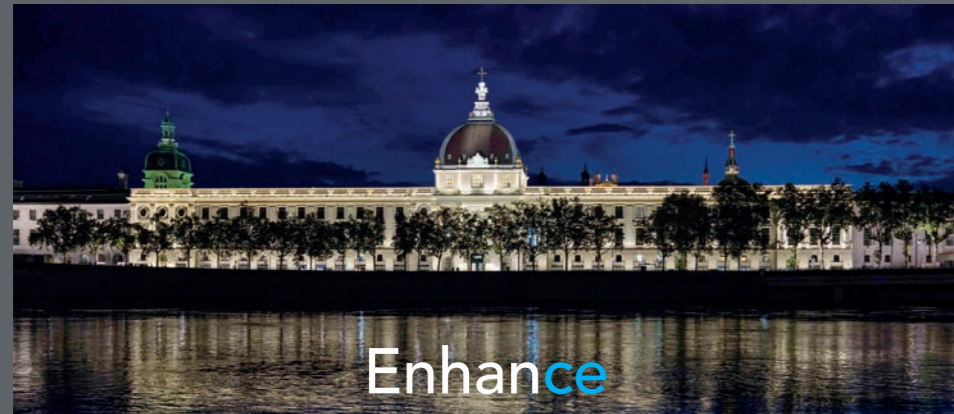
Hôtel Dieu In Lyon