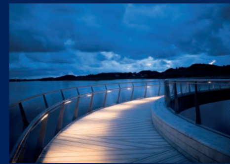
Madlatua Bridge in Norway