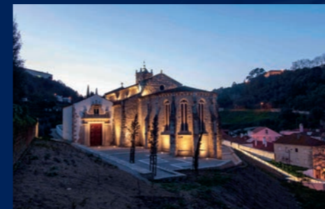
Santarem in Portugal

In the past 40 years, LEC has participated in numerous major exterior and marker lighting projects around the world.